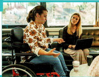
Assistance with Life Stage Transitions