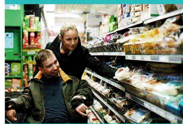
Participation in the Community