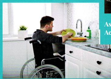
Development of Life Skills